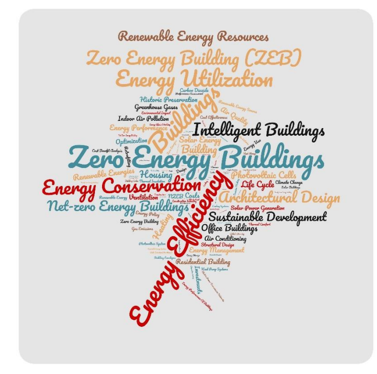
Figure 2. The keywords used globally in the literature according to Scopus [21].

The PED concept introduces an opportunity to develop a framework that introduces energy positivity on a district level, with clear guidelines for grid interaction, energy storage and renewable integration for both buildings and Electric Vehicles (EVs). The main principle of a PED is to create a district within the city that is capable of producing higher energy than it consumes, it is flexible to respond to the energy market situation and in addition to this, it contributes by improving the quality of life and wellbeing of the residents.